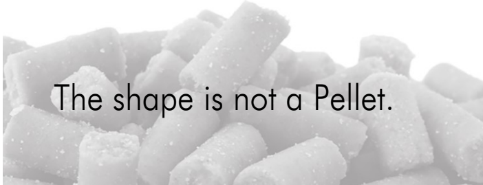
SAFE® U8952 Version 1

To be used within the context of experimental protocols.