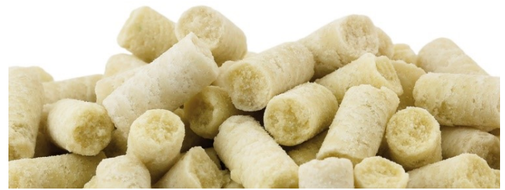
SAFE ® U8959 Version 146