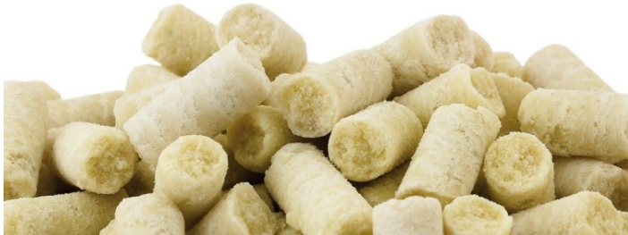
SAFE® U8958 Version 287

To be used within the context of experimental protocols.